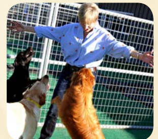
“It’s bliss following a leader!”