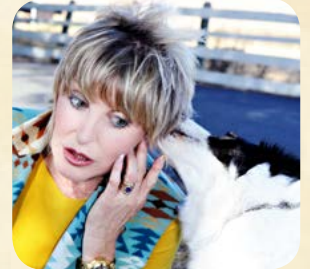
“She speaks our language!”