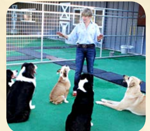
“Who’s the Boss? She is!”